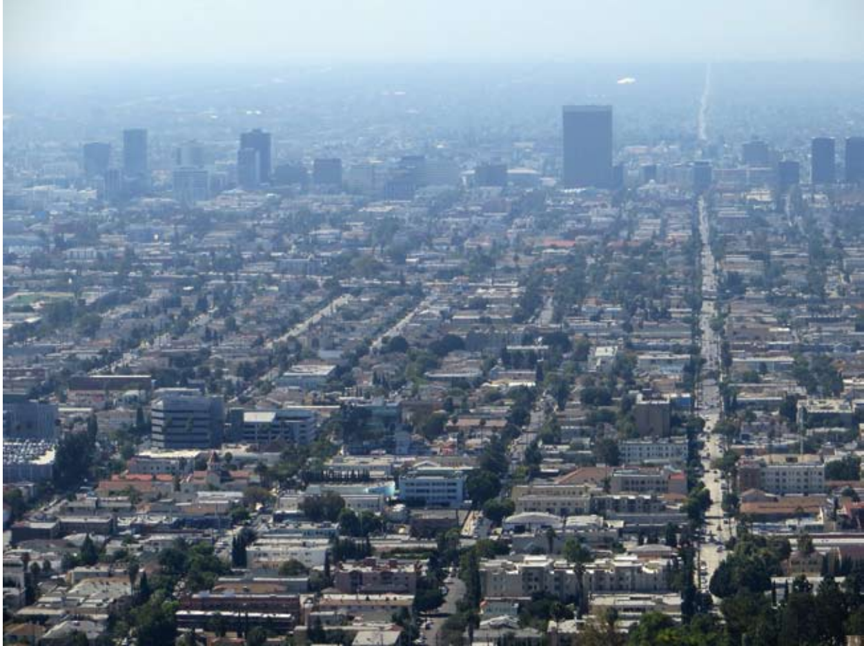
Air pollution over Los Angeles, 2014.

chronic pollution. The Denver, Phoenix, Las Vegas, Salt Lake City and Albuquerque metropolitan areas along with two regions in Texas – Houston and Dallas-Fort Worth – were also among the cities that faced frequent exposure to elevated levels of smog.