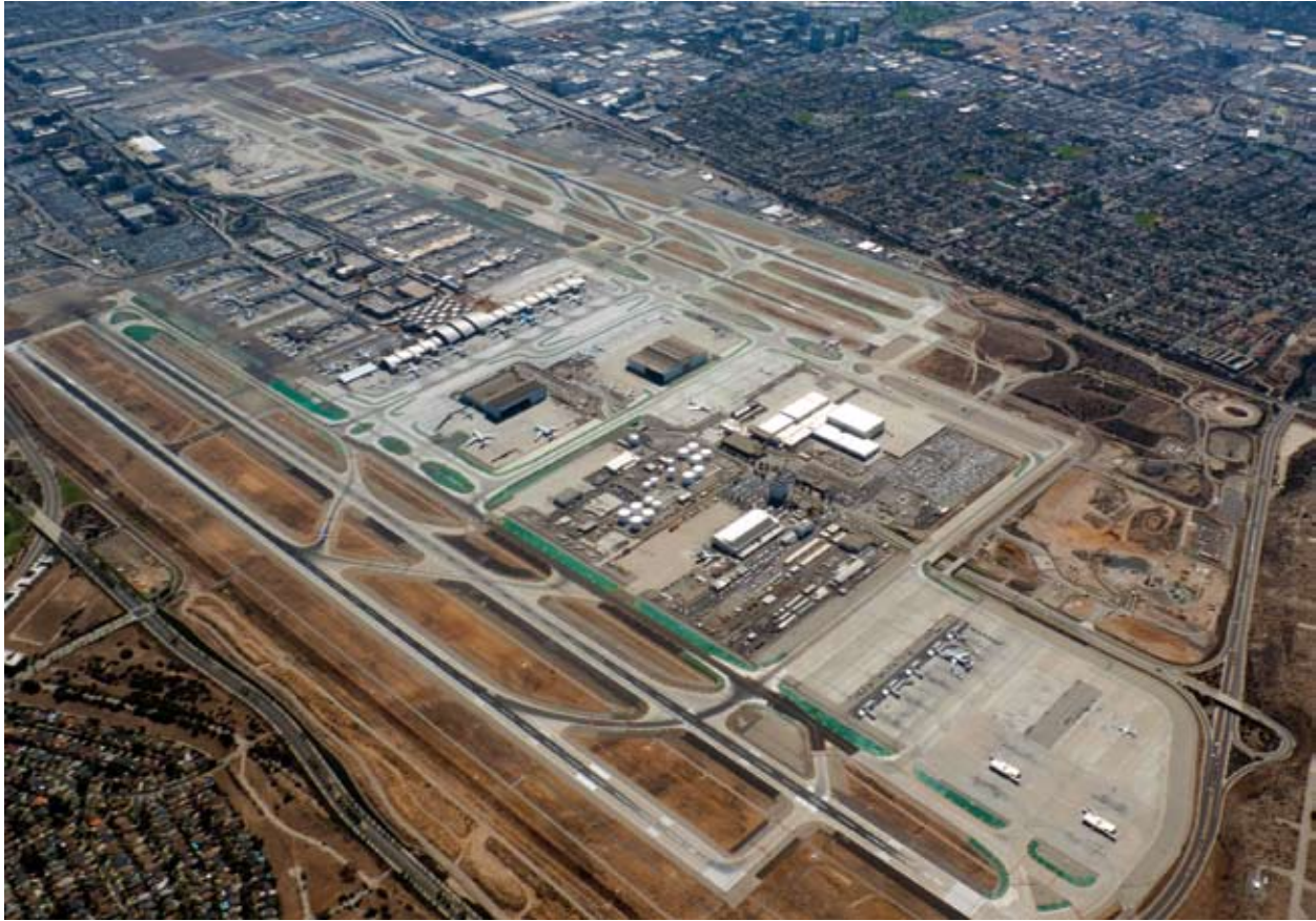
People who spend time downwind of airports, such as those who live in the neighborhoods surrounding Los Angeles International Airport, may experience more health problems than would be expected based on regional air pollution data.

in levels of nitrogen dioxide and black carbon, a type of particulate matter. 49 Figure 1 shows a map of how black carbon concentrations differ across the county. If all areas of Allegheny