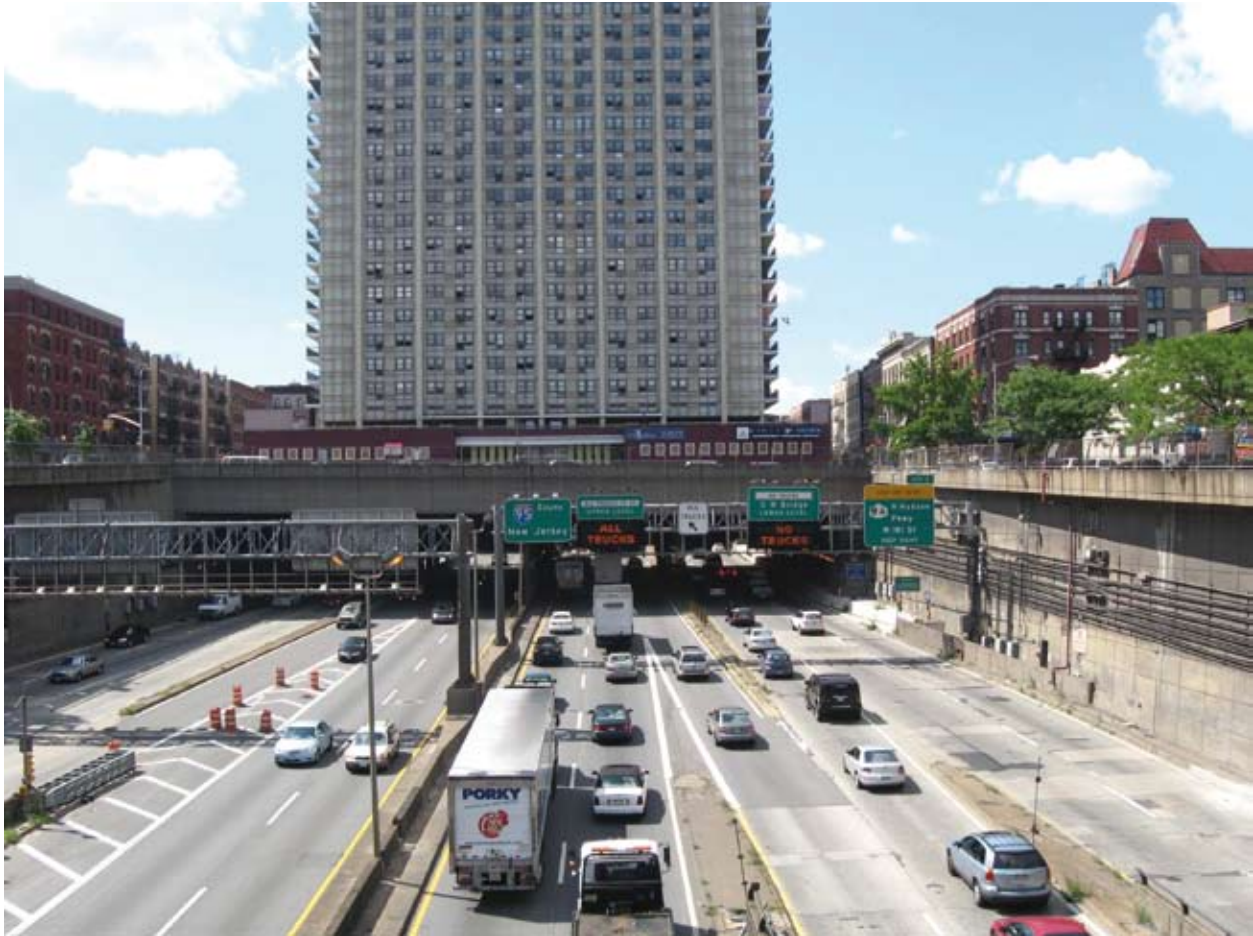
An apartment building has been built above the Trans-Manhattan Expressway in New York City. Living near a highway raises the risk of developing lung cancer, and of dying from stroke, lung disease and heart disease.

cough, wheezing, runny nose and asthma. 44 People living near highways or highly traveled roads face an increased risk of developing lung cancer, and a greater risk of death from stroke, lung disease and heart disease. 45 More than 11 million Americans live within 500 feet of a major highway. 46