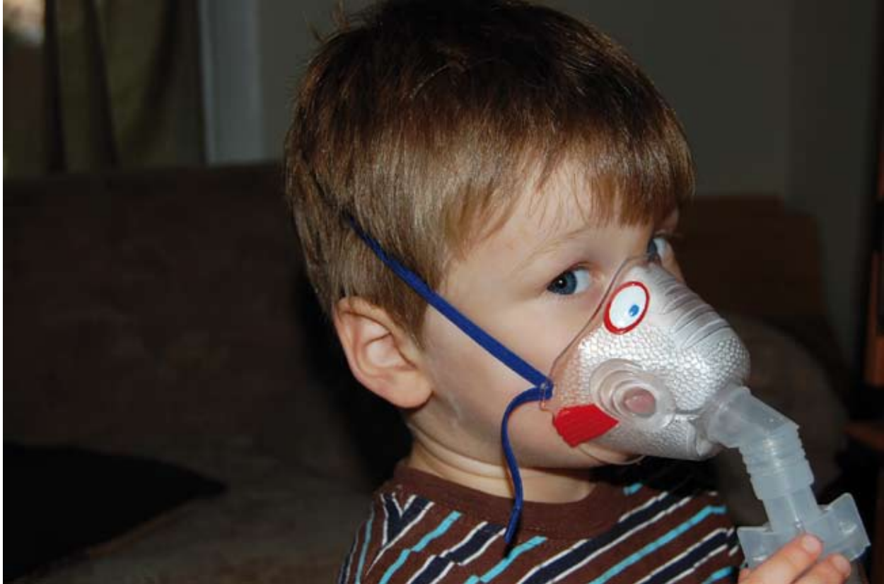
Children are especially vulnerable to ozone's effects.